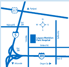
Legacy Meridian Park Hospital