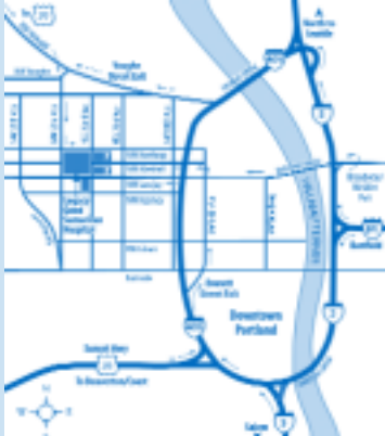
Legacy Good Samaritan Hospital & Medical Center