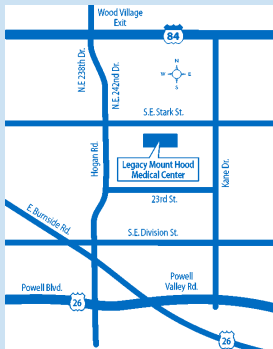
Legacy Mount Hood Medical Center