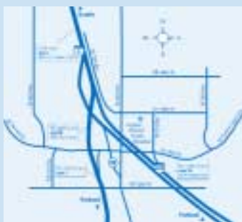
Legacy Salmon Creek Hospital