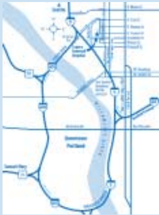
Legacy Emanuel Children's Hospital Emanuel Hospital & Health Center